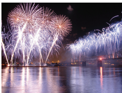
Figure 1. The “Thunder over Louisville” Kentucky Derby fireworks, which could be seen from the Quadruplex Meeting opening reception.